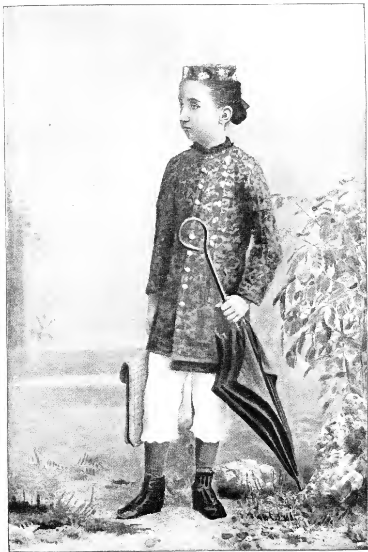
PARSEE SCHOOL GIRL.